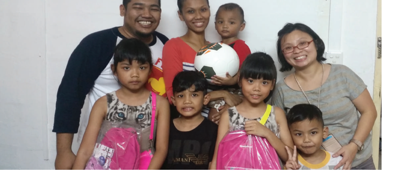
A delighted family received Christmas gifts from HR Department of Bank of America Merrill Lynch (BofAML), 18 December 2014