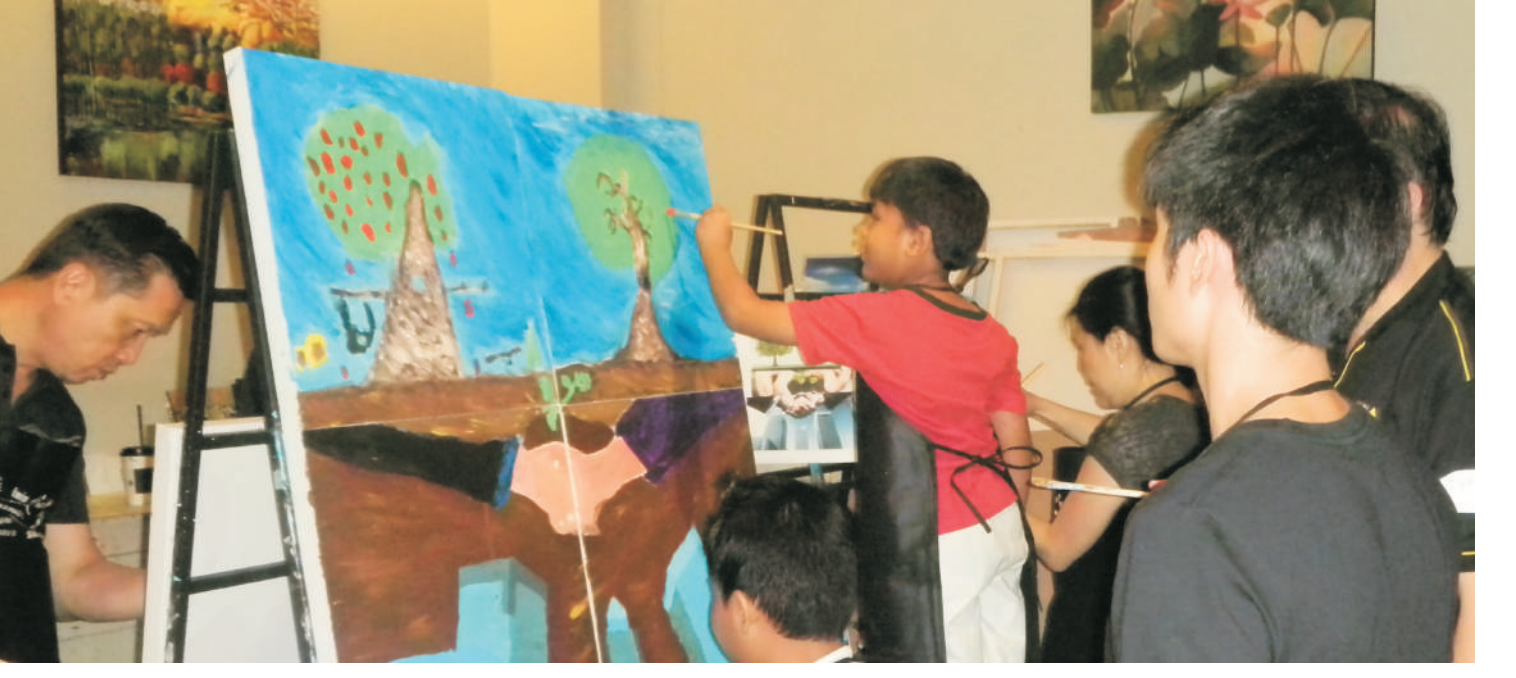
Children painted beautiful art pieces with staff from Axis Communication (Singapore) Pte Ltd, 11 September 2014